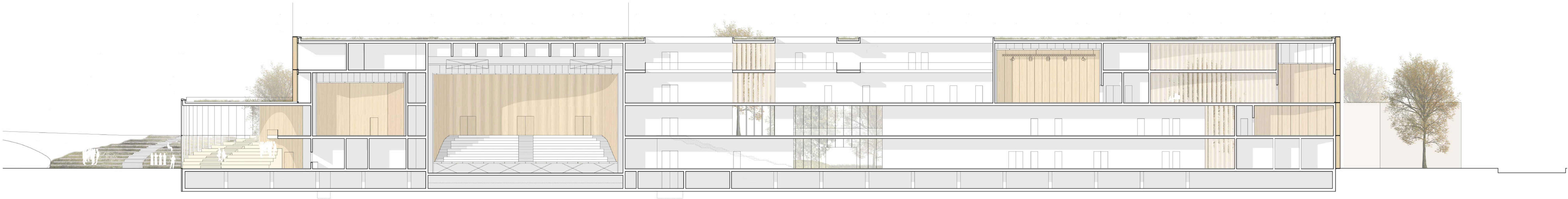
Schnitt B-B M 1:200